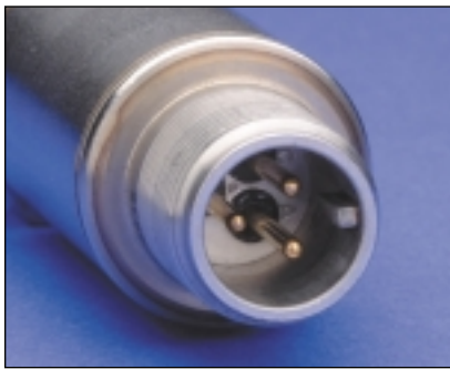
Qualified 3-pin connector

Typical mounting details for thermowell mount. Other arrangements are available.