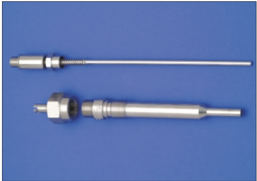
Shown with Thermowell and Adaptor

The Model N9356 Rigid RTD is designed for general purpose temperature monitoring in CANDU design power plants. The design incorporates modern materials which result in a high accuracy and low drift. Whether being used in new plant construction or replacement parts, the Weed design is unmatched in engineering and application flexibility.